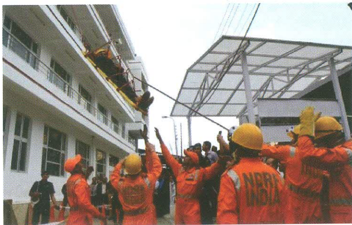
A view of Mock Drill organised at Bhawan on March 28

92 of these employees on the recommendations of designated committee of experts were inducted into Disaster Management Task Force (DMTF) and later conducted joint exercises with Police and CRPF. The training was imparted by the experts of SDRF from Reasi and Jammu and in-house Master Trainers.