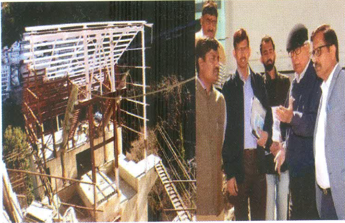
Governor N. N. Vohra inspecting Passenger Ropeway Project on 17 th March 2018

During January-March 2018, Governor N. N. Vohra, Chairman Shri Mata Vaishno Devi Shrine Board, reviewed the ongoing development works thrice on 1 st January, 7 th March and 17 th March.