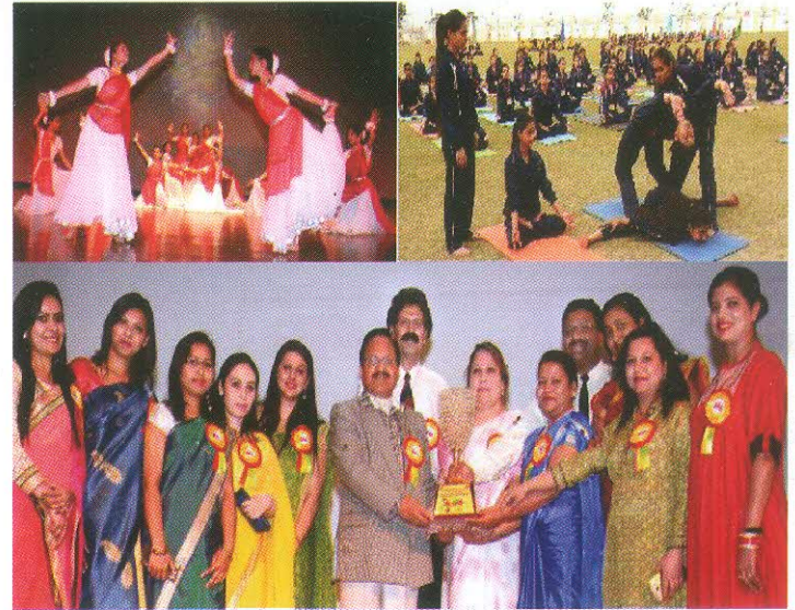
Glimpses of Inter-College Nursing Fest-2018

Shri Mata Vaishno Devi College of Nursing, Kakryal, organised a 2-day Inter-College Competition-Nursing Fest-“Tarang-2018” on 23-24 March in which six Nursing Colleges of the State participated. The events organised included debate, quiz, poster making competition, sports and cultural programmes.