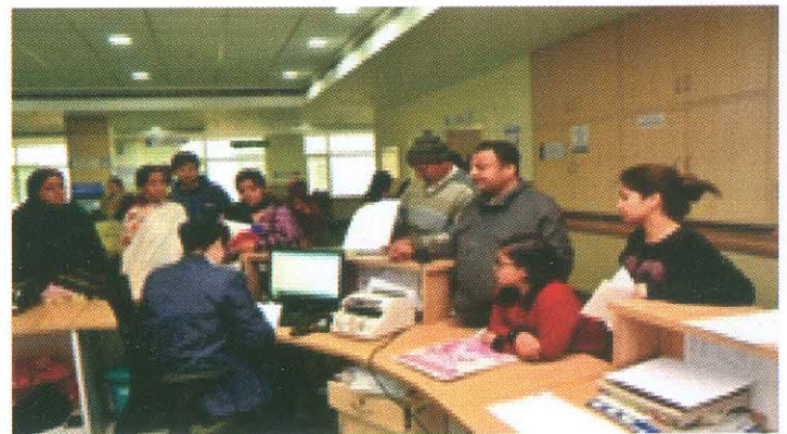
OPD of Superspeciality Hospital, Kakryal

This 230-bed Superspeciality Hospital, Kakryal equipped with state-of-the-art diagnostic and treatment facilities was inaugurated by the Prime Minister on 19 April 2016.