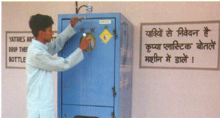
Adoption of technology for scientific disposal of plastic material

Incentive Based Scheme has been operationalized for collection and disposal of PET bottles. Under this scheme, sanitation workforce is encouraged to collect and shift the bottles and other plastic materials to collection centres. The PET bottles generated are first shredded and the final disposal is carried out through an open auction.