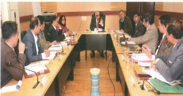
5 th meeting of Shrine Board's Sports Complex held at Katra on 17 th February