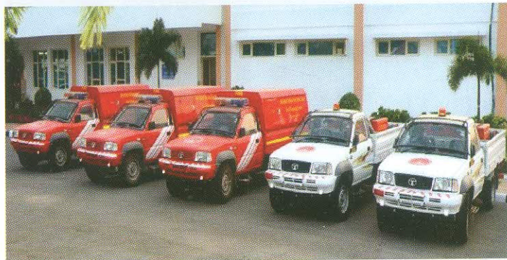
In-house fire fighting units established by Shrine Board

On the directions of Governor N. N. Vohra, Chairman Shri Mata Vaishno Devi Shrine Board, in-house fire fighting units have been established at major Yatra locations – Bhawan, Adhkuwari, Tarakote and Niharika, Katra.