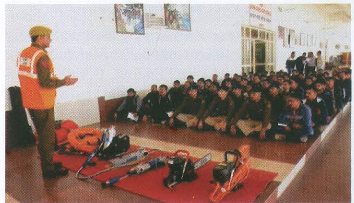
Shrine Board staff participating in Disaster Management training programme on March 5