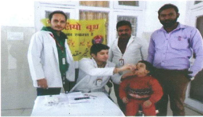
Polio drops being administered to children at Shrine Board's Medical Units

11-13 March 2018. The Shrine Board had made special arrangements for the purpose at its Medical Units.