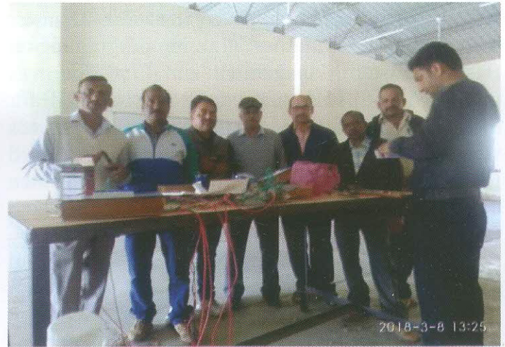
Training programme on capacity building of staff held on March 8

For enhancing skills, building capacities, broadening knowledge base of the Shrine Board employees and efficacious delivery mechanism to facilitate the pilgrims, high importance is being