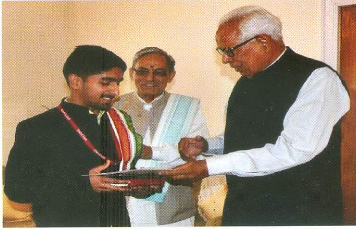
Governor N.N. Vohra felicitating toppers of SMVD Gurukul at Raj Bhavan on 05-03-2018

Governor N. N. Vohra, Chairman of the Shri Mata Vaishno Devi Shrine Board, felicitated 9 outstanding students of the Shri Mata Vaishno Devi Gurukul, Charan Paduka, Katra, for their excellent performance in academics, at a function held at the Raj Bhavan on 5 th March 2018.