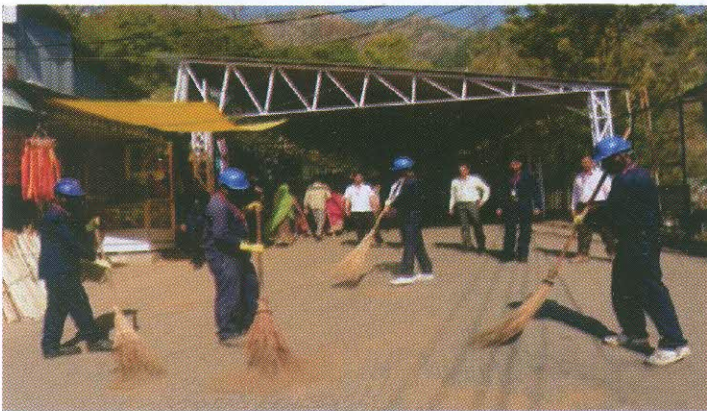
Special sanitation drive organized during Navratras

A team of Board officials associated with sanitation has been nominated as Master Trainers to further impart in-house professional trainings to the sanitation workforce in their concerned sectors.