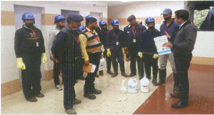
Staff participating in Sanitation Training Programme

A series of training programmes was organised through the experts of M/s Organica Biotech Pvt. Ltd. Mumbai and M/s Sealed Air Gurgaon for Sanitation Supervisors to acquaint them with mechanised cleaning and use of organic liquid solution (made from flower and plant extract) in effective cleaning with emphasis on water conservation. A 4-day training programme was also organised for the Sanitation Supervisors at M/s Organica Biotech Pvt. Ltd. Chembur, Mumbai from 29 th March 2018.