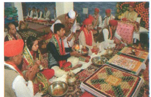
Shat Chandi Maha Yagya concluded with Purna Ahuti on March, 25

Shat Chandi Maha Yagya organized by the Board at the Holy Cave Shrine during Navratras for peace and prosperity, concluded with Purna Ahuti on the auspicious occasion of Ramanavami on March 25.