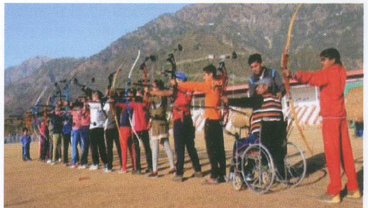
Archers in action at Shrine Board's Complex

During January 2018, a 15-day winter coaching camp was organised by Shrine Board at its Sports Complex with the intent of honing skills of budding sportspersons of the area. Chess, Carrom, Badminton, Volleyball, Tug of War and Table Tennis tournaments were organised for Shrine Board employees during the period. The coaching camps were also organised in different disciplines like Archery, Basketball, Rifle Shooting for the SMVD University students.