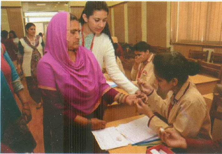
Students of Nursing College conducting health checkup on International Women's Day on March 8

As part of celebration of International Women's Day on 8 th March 2018, SMVD College of Nursing, Kakryal, organised health screening camp for women employees of the Shrine Board at Spiritual Growth Centre, Katra. The women employees were screened for vital signs like HB estimation and Blood Sugar and given basic awareness on health and sanitation issues. A similar awareness camp was also held at Kakryal to commemorate this day.