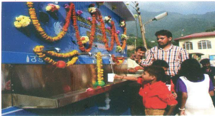
Ultra Filtration based Water Kiosks installed on the track

To provide ultra filtered quality drinking water to the pilgrims free of cost, 55 Ultra Filtration based Water Kiosks are being installed by the Board from Darshani Deodi to Bhawan at an estimated cost of Rs. 10.06 crore. Eleven of these Kiosks have already been commissioned at different locations recently, while the remaining 44 Water Kiosks are under the process of installation. 14 Ultra Filtration based Water Kiosks are also planned to be installed on the upcoming Tarakote Marg.