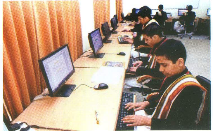
SMVD Gurukul students in Computer Lab