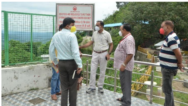
CEO Shrine Board conducts Track Inspection; reviews various arrangements in view of monsoon

catering, healthcare facilities, sanitisation and cleanliness and the expeditious clearance of track in case of any debris or landslides falling on the track due to heavy rains to ensure smooth movement of the pilgrims. Other pilgrim-centric arrangements reviewed on the track included Battery Operated Vehicles between Adhkuwari and Bhawan as well as Bhawan-Bhairon Ghati Passenger Ropeway and the security and other aspects of the pilgrimage. He was accompanied with Dy. CEOs, concerned engineers and other officers of the Shrine Board.