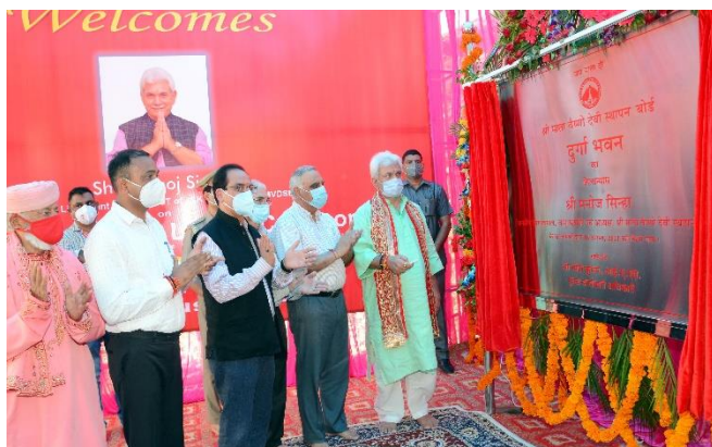
Lt Governor, Sh. Manoj Sinha during foundation stone laying ceremony of Durga Bhawan at the Holy Shrine of Shri Mata Vaishno Devi Ji.

Sinha, who is also the Chairman of Shri Mata Vaishno Devi Shrine Board, has been giving high priority to enhancing facilities for the convenience of the pilgrims. On completion, the facility will accommodate 4000 pilgrims.