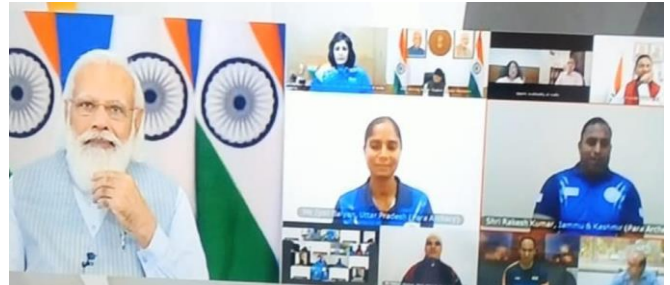
PM Modi interacts with Archers of Shrine Board's Sports

Prime Minister also interacted with their families from their native places. These Archers have qualified for Tokyo Paralympic Games scheduled to be held between August 24 and September 5.