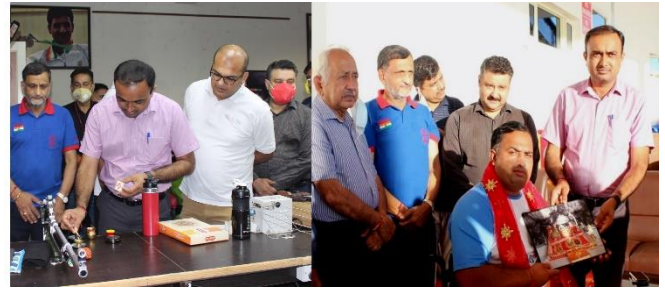
CEO SMVDSB felicitates Tokyo Paralympics Participants; Inaugurates Shooting Ranges.