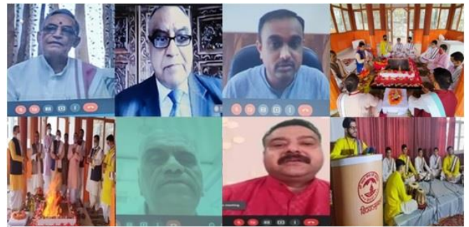
Annual Day Celebration of Shri Mata Vaishno Devi Gurukul