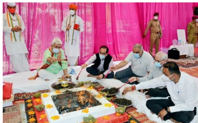
Lt Governor Sh. Manoj Sinha performs Havan during foundation stone laying ceremony of Durga Bhawan

Recalling the meeting held in the month of March, Sinha observed that specific directions were passed to the concerned agencies to aesthetically design the building, besides providing maximum convenience to the devotees