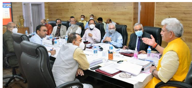
Lt Governor, Sh. Manoj Sinha chairing 68 th meeting of SMVDSB at Raj Bhavan, Jammu.

The Board took stock of the functioning of the Call Centre established with an initiative towards optimum utilization and dispersion of real-time information of the facilities created for the pilgrims. The initiative aimed at providing much-needed assistance to the pilgrims to plan their visit to this most revered holy shrine, keeping in view the prevailing weather conditions.