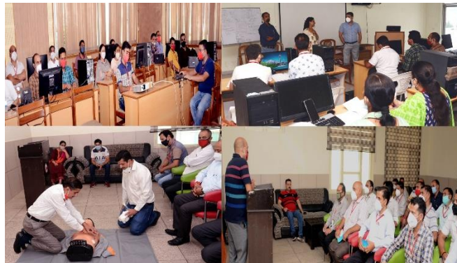
Training programmes conducted by Shri Mata Vaishno Devi Shrine Board for staff working in various units

Training Programme on the STP installed at Adhkuwari and Basic F&B services (especially for VVIP services) etc.