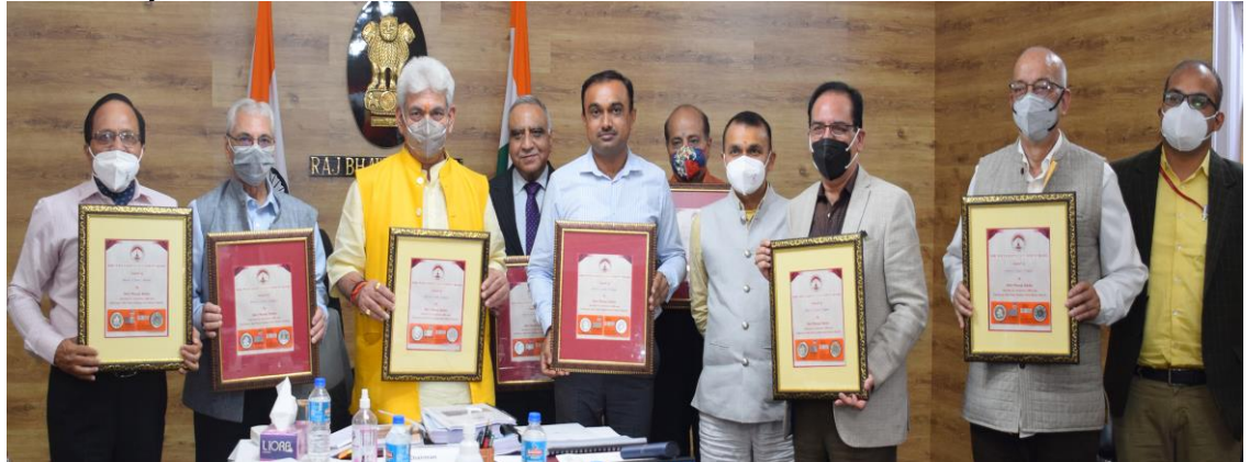
Lieutenant Governor, Sh. Manoj Sinha released 20-gram Silver Souvenir coin.

Lieutenant Governor, Manoj Sinha, Chairman of Shri Mata Vaishno Devi Shrine Board, on 16 September released 20-gram Silver Souvenir coin (999 fineness) ahead of the "Sharad Navratras and Diwali" for millions of devotees worldwide during the 68th meeting of the Shri Mata Vaishno Devi Shrine Board at the Raj Bhavan.