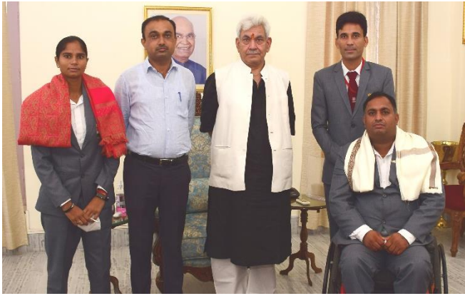
Lt Governor Sh Manoj Sinha honours Tokyo Paralympics Participants