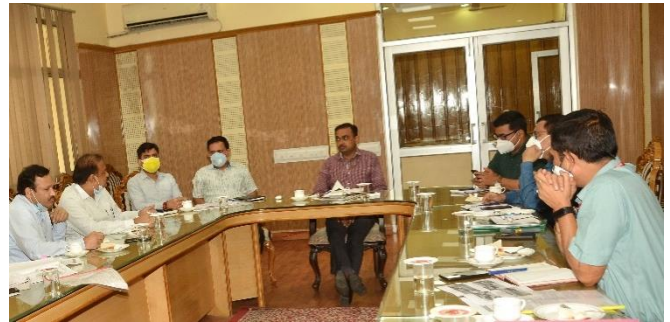
CEO Shrine Board reviews Hi-Tech Multipurpose Video Wall Project of Shrine

besides, providing information of missing persons / items and early warnings of weather forecast. The project will also provide general information to the visiting pilgrims such as Medical & Ambulance Facilities, Accommodation & Catering arrangements, Water & Toilet locations, General Announcement/ Assistance Information and Do's and Don't etc.