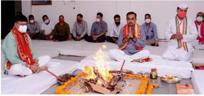
Shri Mata Vaishno Devi Shrine Board Celebrates Foundation Day

Video Walls and construction of Durga Bhawan.