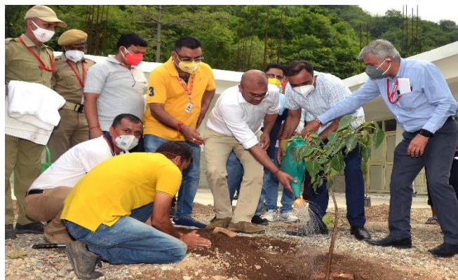
CEO Shrine Board launching plantation drive

The Shrine Board will plant 1.33 lakh quality seedlings of different species under its Annual Greening Plan during the current financial year thereby bringing another 73 hectares area under green cover.