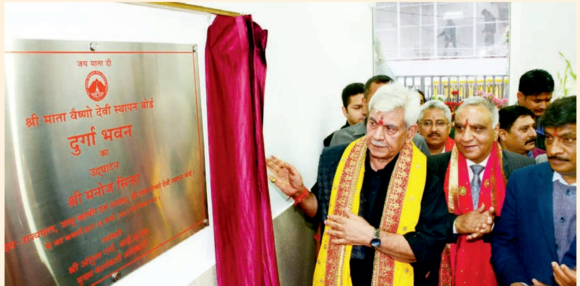
Hon'ble Chairman, SMVDSB (Lt Governor) inaugurated newly constructed Durga Bhawan at Bhawan

“The Shrine Board has started various new initiatives for providing better facilities to the pilgrims. Spiritual and cultural heritage is being revived by building modern infrastructure and administration is committed to ensure that devotees on sacred pilgrimage are looked after well,” said the Lt Governor.