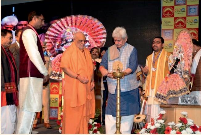
Inauguration of North Zone Youth Festival 'KSHITIJ'

He further added that North Zone Youth Festival will lead to a better understanding of the various aspects of Sanskrit Studies and knowledge system and efforts are being made to increase access of students to make it language of common man.