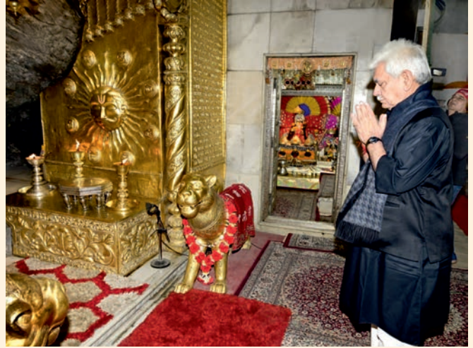
Hon'ble Chairman, SMVDSB paid obeisance at Shri Mata Vaishno Devi Shrine

The inaugural ceremony commenced with the Lt Governor along with Board members and Chief Secretary taking part in the hawan and pooja rituals.