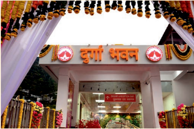
Newly inaugurated Durga Bhawan at Bhawan

The Lt Governor also underscored that the interests of traders, pony walas, local business community and other stakeholders are being safeguarded while developing the facilities for the devotees while declaring that a ropeway from Tarakote to Sanjichhat will come up soon. He assured the local people, traders and all the stakeholders that the ropeway facility will be provided to only elderly, sick and specially-abled devotees as limited capacity of devotees has been kept per day. There will be no impact on the livelihood of traders, business community and ponywalas, said the Lt Governor.