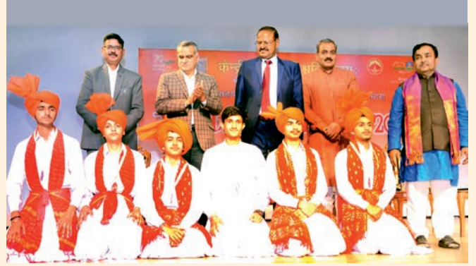
Award winning SMVD Gurukul students in first ever North Zone Youth Festival held at Katra

promotion of Sanskrit in the Union territory as per the directions of Hon'ble Chairman, SMVDSB (Lieutenant Governor, JK-UT).