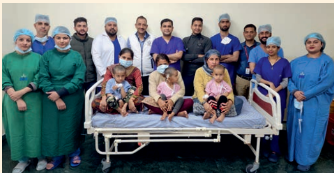
Shri Mata Vaishno Devi Narayana Superspeciality Hospital performs three cochlear Implant Surgeries