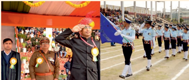
CEO, SMVDSB taking salute at Republic Day function.

upgradation and expansion of civic amenities at Katra, Shrine Board has taken up works at Government High School and Hansali circular road. He also highlighted many government schemes initiated had now reached the doorsteps of people including Jal Jeevan Mission (JJM) Land reforms and various digitization services by the government besides, the construction of six-lane Delhi-Amritsar-Katra Expressway by which the travel time from Delhi to Vaishno Devi will be reduced to six hours. He underscored that the setting of Inter Model Station has been mooted at Katra so that the pilgrims could move from one mode to another with minimum intervention/use of automobiles which is destined to improve the travelling experience of the pilgrims visiting Katra.