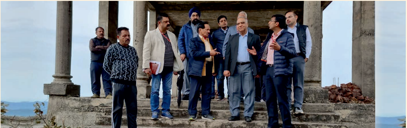
Visit of team of Shrine Board & technical expert to Shankaracharya Temple

the building premises side-by-side taking care of the ecology of the area. Besides laying of tiles on the track leading to the Shankaracharya Temple and the installation of LED lights with poles, the condition of the access road/ track leading to the temple will be improved. In addition, basic infrastructure development shall include provision of viewpoints enroute, adequate, safe and clean drinking water, hygienic food, medical and sanitation facilities.