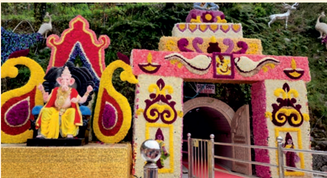
Floral decoration of Shri Mata Vaishno Devi Bhawan during Chaitra Navratra

Adorned with thousands of multi-hued flowers, the holy shrine of Mata Vaishno Devi Ji was all set to host pilgrims expected to visit the shrine of Mata Vaishno Devi Ji in large numbers during the nine-day Navratras beginning from March 22.