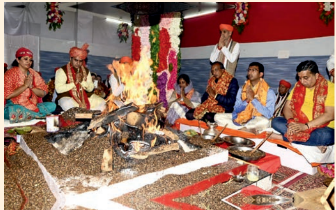
Shat Chandi Maha Yagya concludes with Purna Ahuti

to the aesthetics of various locations on the track in these Navratras. Other special features were bhajan and bhaint performances by the renowned artists such as Gurdas Maan, Hansraj Raghuwanshi, Maithili Thakur and Lakhwinder Wadali etc during morning and evening Atka Aarti during these Navratras.