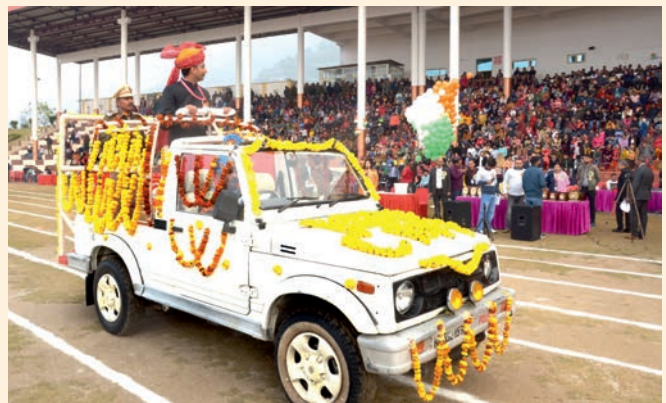
74 th Republic Day celebrations at Katra