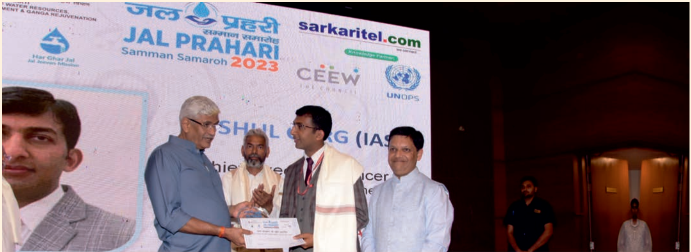
SMVD Shrine Board felicitated for water conservation and management