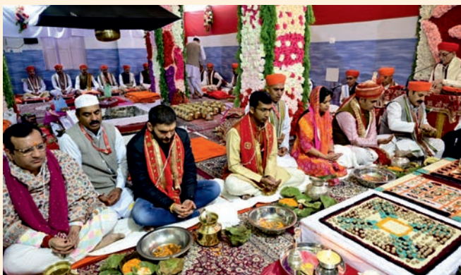
Shat Chandi Yagya started during Chaitra Navratra

Likewise, the illumination of the Bhawan area with attractive and colourful lights were done. The breath-taking and festive decorations were a special visual delight for pilgrims who trek about 12 km from Katra to Bhawan.