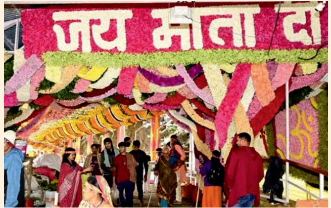
Artistically decorated Shri Mata Vaishno Devi Bhawan during Chaitra Navratra

which included pony and battery car services on complimentary basis, besides, priority darshans at sanctum sanctorum during Navratras.