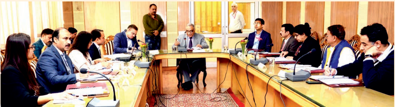
Governing Council meeting of SMVD Sports Complex

and Army Personnel with the target participation of about 1000 persons for generating interest and greater participation. The GC also directed to organize sports activities at SMVDSB Sports Complex once in a month preferably on Sunday for students of Katra and adjoining areas with a view to catch them at earlier stages from April in order to search the sports talent in Reasi and its surrounding areas to develop them into competitive athletes so that the students could be imparted specialized coaching to groom them for participation in various national and international competitions.