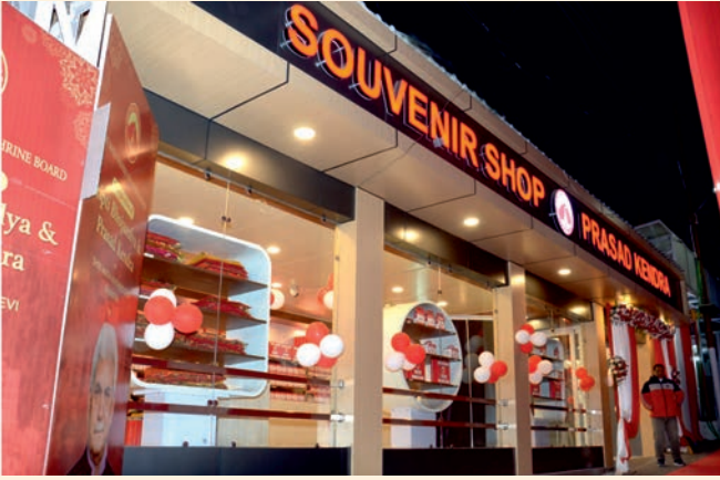
Prasad Kendra cum Souvenir Shop at Bhawan

He further added that North Zone Youth Festival will lead to a better understanding of the various aspects of Sanskrit Studies and knowledge system and efforts are being made to increase access of students to make it language of common man.