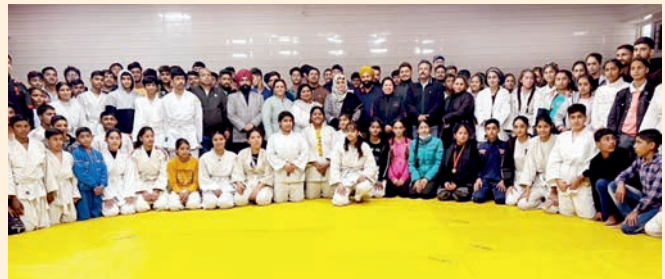
Shrine Board's Sports Complex Judokas who participated in National Judo Championship.

As many as 22 Judokas trained and groomed at the Shrine Board's Sports Complex, Katra participated in all the categories of this championship and won 3 gold, 11 silver and 7 bronze medals.